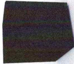
HON - VOI MOBILE BF PED